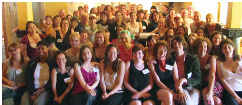
"Learn it, Make it, Live it" – CCE 2010

"Absolutely amazing...it'll blow you out of the water with all the cutting edge talent."